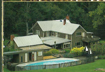
FARMHOUSE INN AND COZY COTTAGE