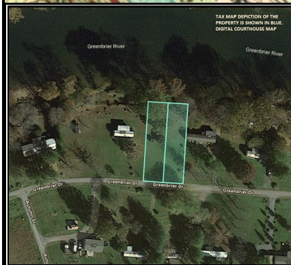
TAX MAP DEPICTION OF THE PROPERTY IS SHOWN IN BLUE. DIGITAL COURTHOUSE MAP